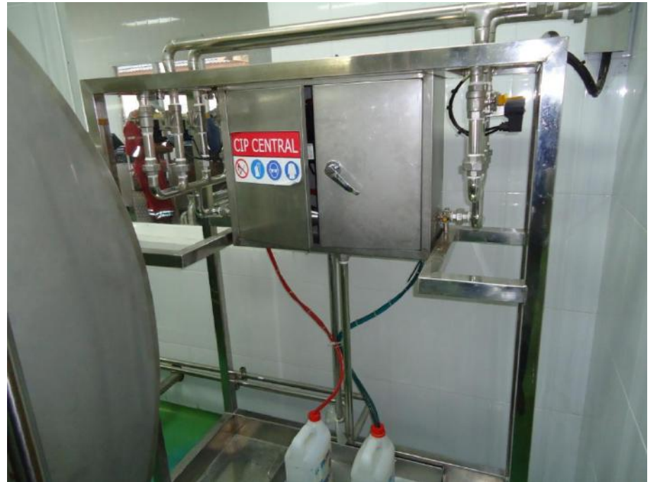
Milk storage room, with coated floor, tiles on the wall and smooth ceiling