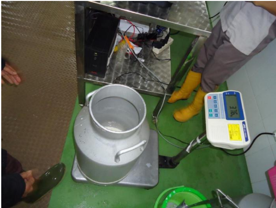
Kg measurement by electronic scale