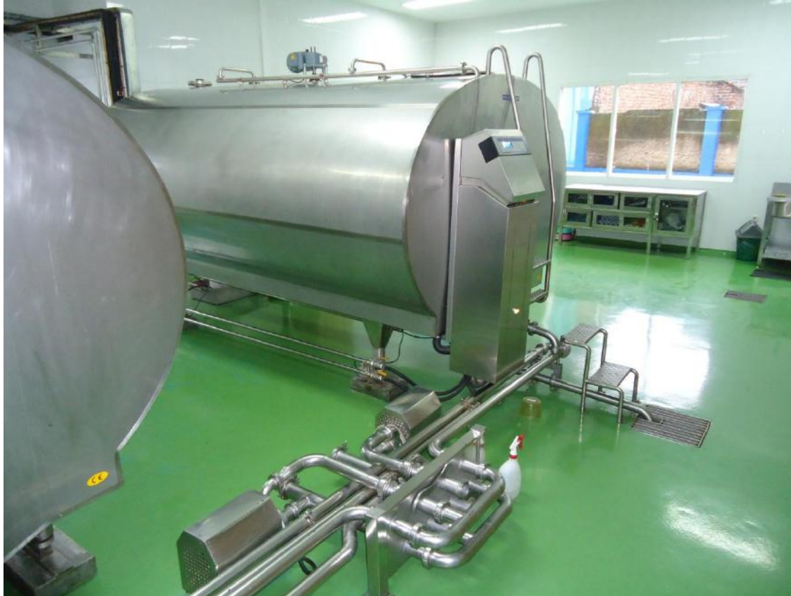
Milk storage room, with coated floor, tiles on the wall and smooth ceiling