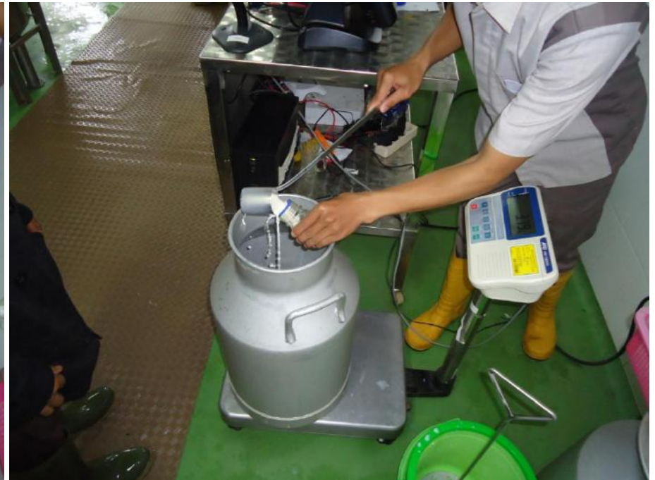
Individual sample for antibiotic testing in case tank analysis indicates antibiotics (tracing “wrong” farmer)